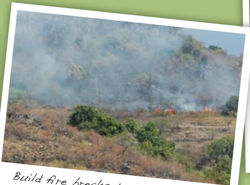
Build fire breaks to protect the tree saplings