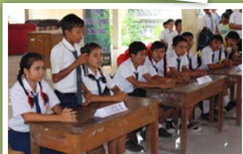
Teach local children