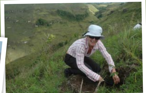
Plant tree saplings on FPNP's reforestation sites