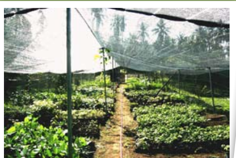
Assist in the nursery