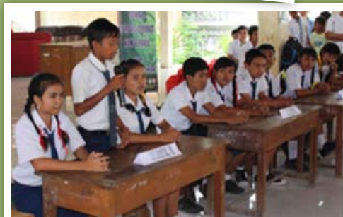
Teach local children