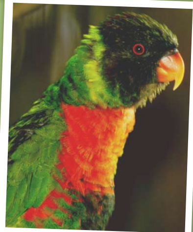
Assist in the rehabilitation and release of birds