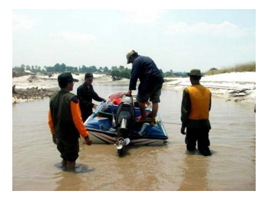
Tanjung Puting National Park.

When fire fighters from Tanjung Puting National Park (BTNTP), Central Kalimantan Agency for Conservation of Natural Resources (BKSDA Kalteng), Orangutan Foundation, Orangutan Foundation International, Friends of National Park Foundation tried to damped the forest fires in park the extreme low tide prevented the speed boat from getting through.