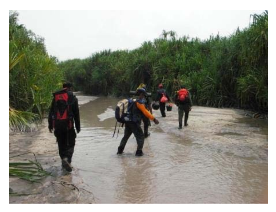
Tanjung Puting National Park.

When fire fighters from Tanjung Puting National Park (BTNTP), Central Kalimantan Agency for Conservation of Natural Resources (BKSDA Kalteng), Orangutan Foundation, Orangutan Foundation International, Friends of National Park Foundation tried to damped the forest fires in park the extreme low tide prevented the speed boat from getting through.