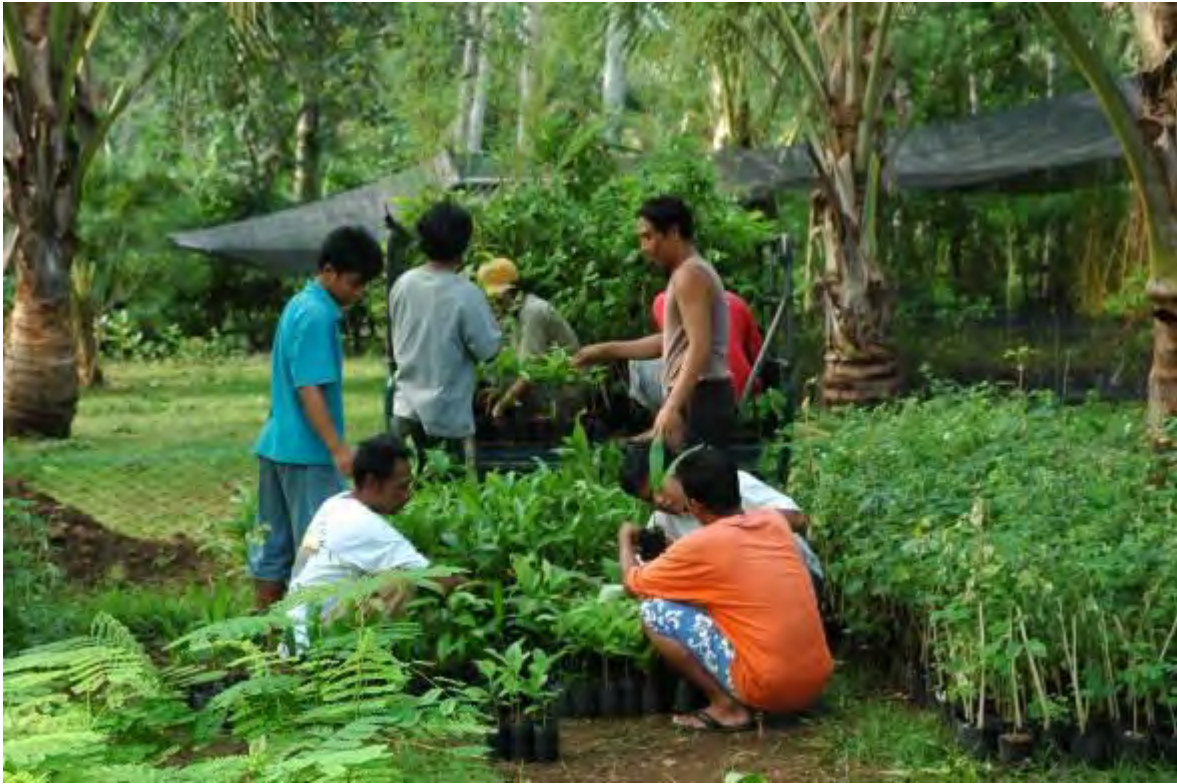
Seedlings delivered to the village of Bendesa Pekraman by trucks

Based on last road side tree planting, in 2013 we planted 8,672 trees from Toya Pakeh village up to Karang Sari village. The distance between these villages is 17km. Besides Gamelina seedlings, we also planted another trees, such as: Palem Putri seeds, Palem Ekor Tupai, Singapor, Klampoak, Ketapang, and Trembesi.