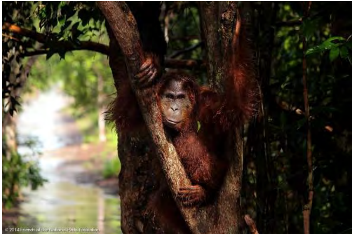
Lone Orangutan observing us at Tanjung Puting National Park

Both areas are low-land protected forests dominated by peat swamps which provide vital habitats for orangutans ( Pongo pygmaeus ) – an endangered and protected species under the International Union for Conservation of Nature (IUCN) Red List – and other wildlife. The two wilderness parks are home to some of the last remaining protected habitat sites containing large orangutan populations.