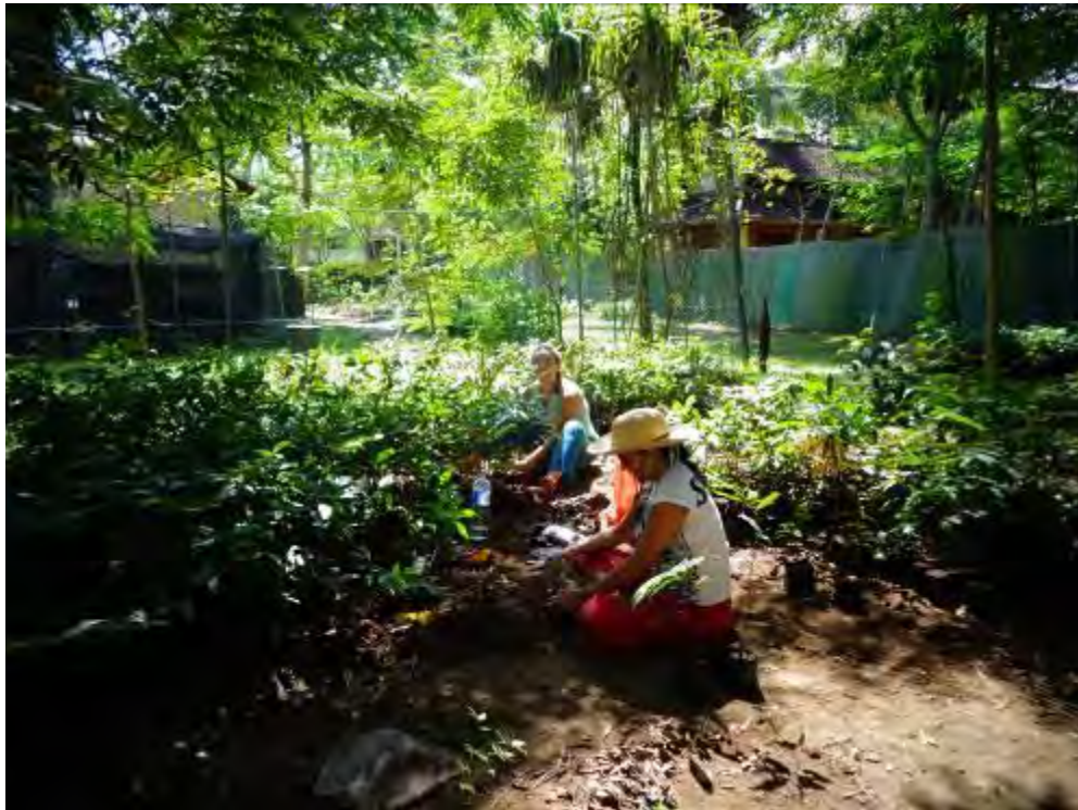
Volunteers helping out in our greenhouse and conservation center at Ped village, on Nusa Penida island.

Most importantly, the volunteer program is a significant income stream allowing FNPF to run other programs which have yet to find donors.