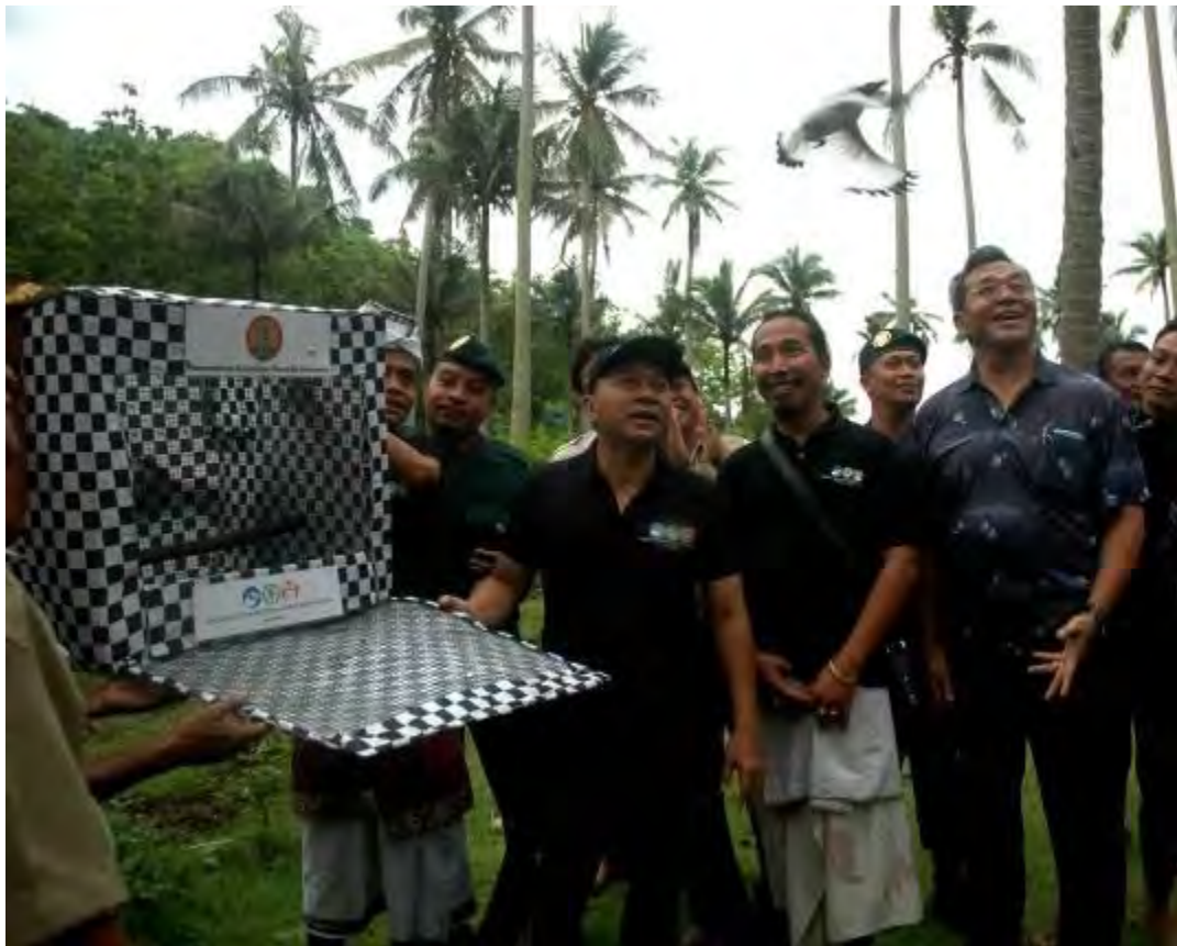
Indonesia's Minister of Forestry visited Nusa Penida on the last day of 2013 attending an event to release a pair of critically endangered Bali starlings (Leucopsar rothschildi)

On 31 December 2013, we closed the year with the Indonesian Minister of Forestry, Mr. Zulkifli Hasan, who attended the ceremonial release of a pair of the critically endangered Bali Starlings back into the wild at the bird sanctuary in Nusa Penida island.