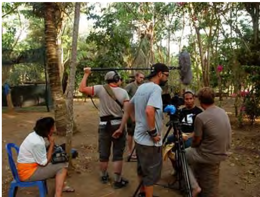
Film crews from the US's Born to Explore with Richard Wiese at FPNP's Community Centre on Nusa Penida.

The whole team also enjoyed hosting the film crew from ABC TV (USA) Born to Explore with Richard Wiese, South Africa's Earth Touch TV, and some local television teams, and other and media, producing film documentaries on visits to Kalimantan and our bird sanctuary on Nusa Penida.