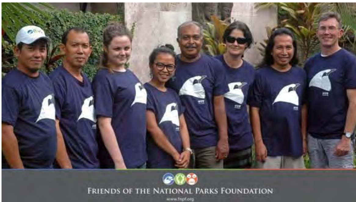
Our fantastic team of director, staff and volunteers at FPNP's Headquarter Office in Ubud.