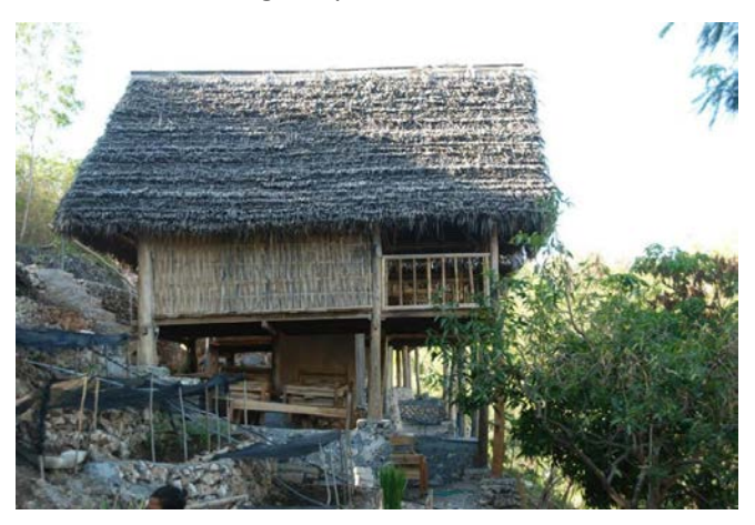
Our newest center was designed using locally produced materials and traditional construction design.

In the same year, we built an organic farming plot in the new center. The new facility has presented a unique challenge for us. Unlike the level ground at the old center, the new one is filled with steep hills and big lime stones. We consulted with the local farmers and they helped us build a cascading farmland suitable for the topography of the land. Water is also a serious issue in the new center. The main water source is quite far from it and we have to rely on the ground water source for watering the plant.