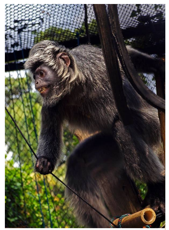
Leaf Monkey (Trachypithecus obscurus)

Our facilities in Tanjung Puting (Borneo) and Tabanan (Bali) are our most successful facilities. In Borneo, we have been working since 1997 in two massive sites. The first is the Tanjung Puting National Park and the second is the Lamandau River Wildlife Reserve. These two sites are very important because they are where the critically endangered orangutan ( Pongo pygmaeus ) are being protected and rehabilitated. In Tabanan, we operate the Bali Wildlife Rescue Center (BWRC), a well-established facility where we care, rehabilitate, and release animals which mostly are victims of illegal trading and poaching.