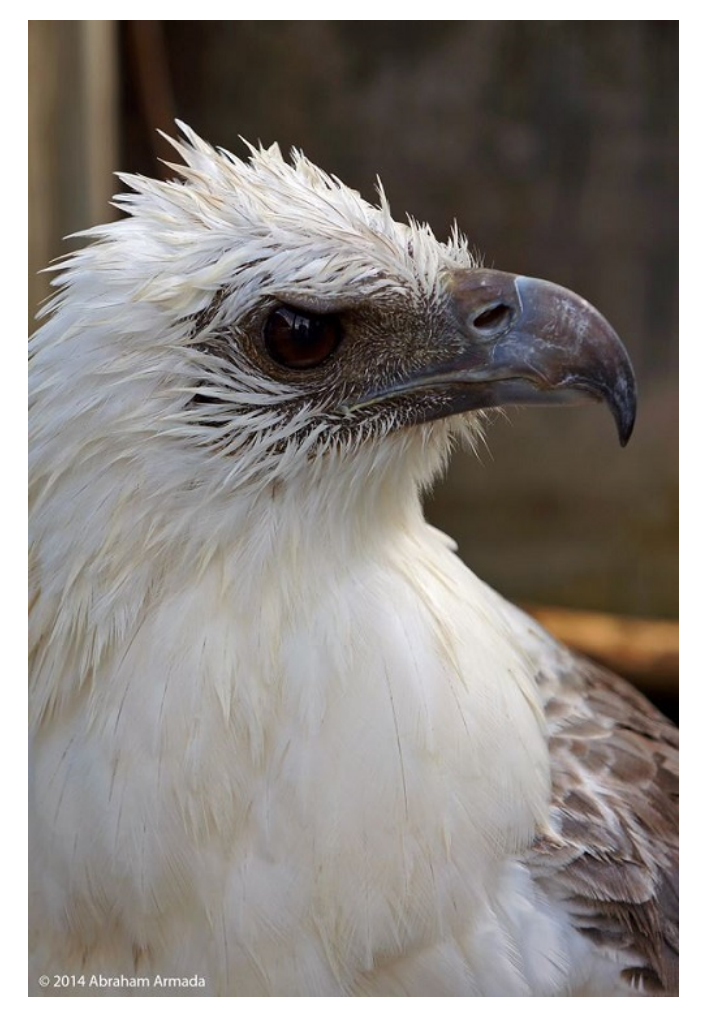
White bellied Fish Eagle (Haliaeetus leucogaster) at our BWRC site.

Sadly, several animals have died. The cause of deaths were varied from fighting with other animals to bacterial infection. Several birds were dead because of the avian influenza outbreak. Our investigation conclude that it was the wild birds that has brought the disease in to our facility. These birds probably got the disease from free-range chickens from nearby villages. Two newly arrived crocodiles were found dead. Post mortem examination have discovered several objects such as bamboos and glass bottles in their stomach.