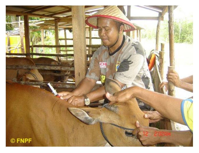
Giving vitamin to cows at our Padang Sembilan center.

Livestock projects remain strong in Jerumbun, Sei Sekonyer, Pesalat, and Beguruh. Cows proved to be the most fruitful livestock as they can provide people with milk, meat, and manure to support our agroforestry project. When it first began many people were sceptical about raising cow in the middle of unfertile land. However, our staff proves that with the right knowledge and high determination we can change the sandy area into a green pasture enough to support a herd of cows. The unsung hero here is the manure which fertilize the land and support the growth of elephant grass (Pennisetum purpureum) which is eaten by the cow in return.