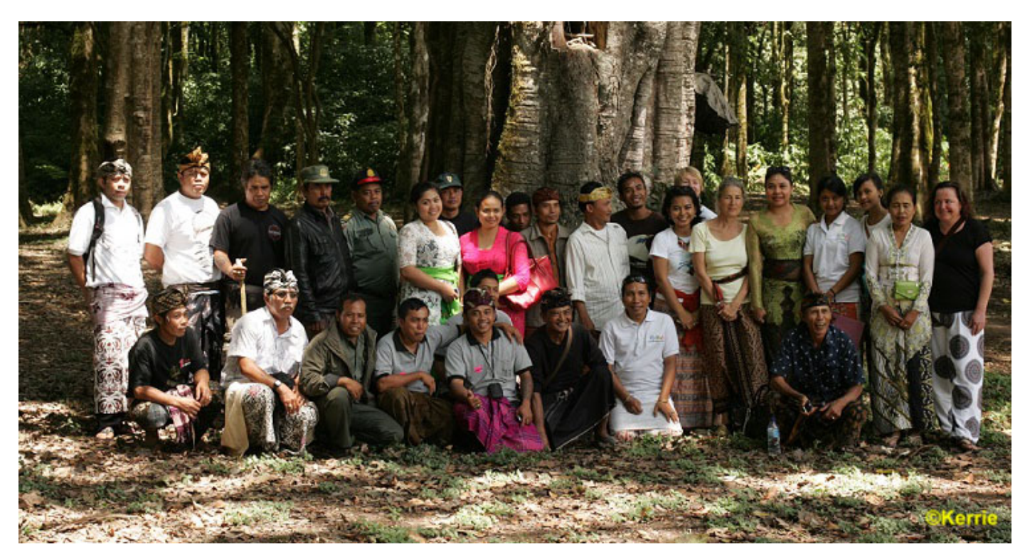
Our team taking picture with volunteers, and local community

And the hundreds of volunteers from all over the world who have so generously given their time to FNPF, whether they be assisting in our nursery, planting trees, teaching students English or about conservation issues, building fire breaks on reforestation sites, or working in one of our demonstration organic gardens.