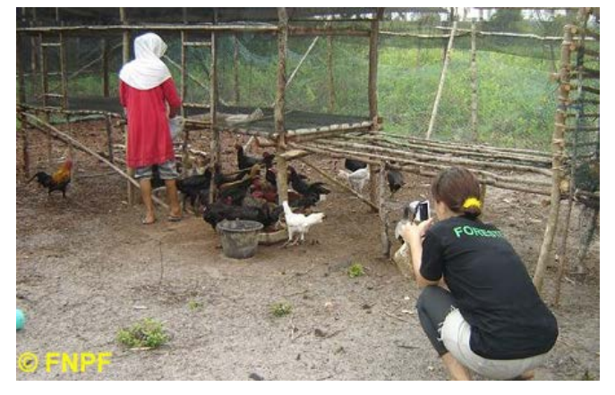
Chicken farm at our Padang Sembilan center.

Previously, all of the products sold in the market were taken from the forest and we are concerned about the possibility of species extinction if people keep taking them from the wild and never grow it in a sustainable pattern. During this period, we also started to set up a fruit tree nursery that will be planted and cultivated around the property and at the edge of the existing forest buffering palm oil plantation to provide food for some wildlife that remains in this area.