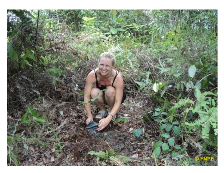
The volunteer planting trees at our Pesalat site.

volunteers can also participate in educational activities that are part of the projects. This activities can include teaching in local school focusing on the importance of conservation or teaching the local farmer the benefits of sustainable farming.