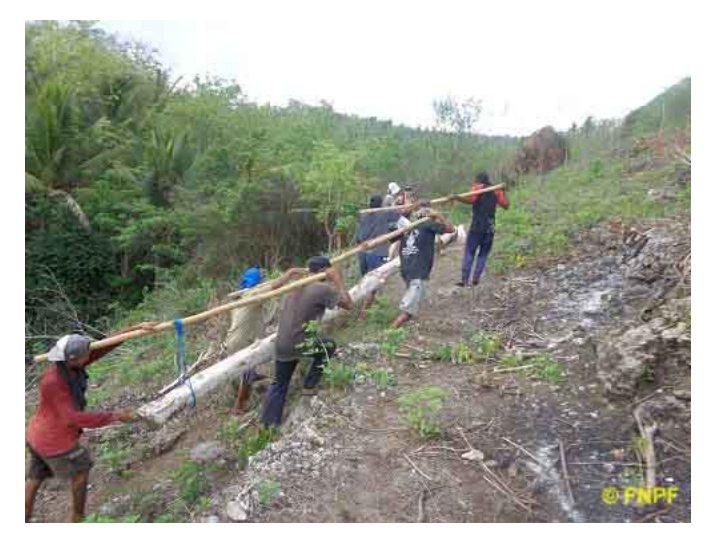
The volunteers and local villagers hauling logs for building the new center.

Several challenges emerged in 2014 which are mostly related to the relocation process. The first challenge was the condition of the road which cannot service big vehicles like bus and truck. Scooters also have difficulty navigating this road. A narrow footpath through the organic garden can provide shortcut to the main road. However, with no light at night this footpath can be dark and hard to navigate.