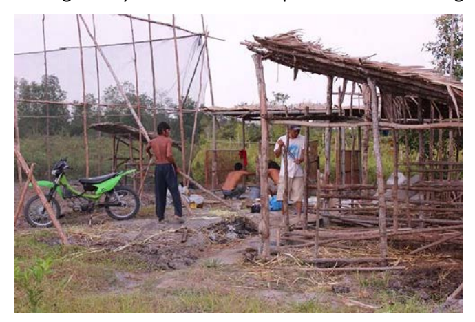
Building chicken coop for local farmers at Jerumbun.

Our main project there is the agroforestry in several villages near the Tanjung Puting National Park. In Jerumbun village, we built tree nursery which provide the villagers with saplings of tree that can produce fruit such as guava ( Psidium guajava ), duku ( Lansium parasiticum ), and gaharu ( Aquilaria beccarain ). Similar sites also exist in Pesalat, Padang Sembilan and Sei Sekonyer. These nurseries are managed by the local cooperative and being