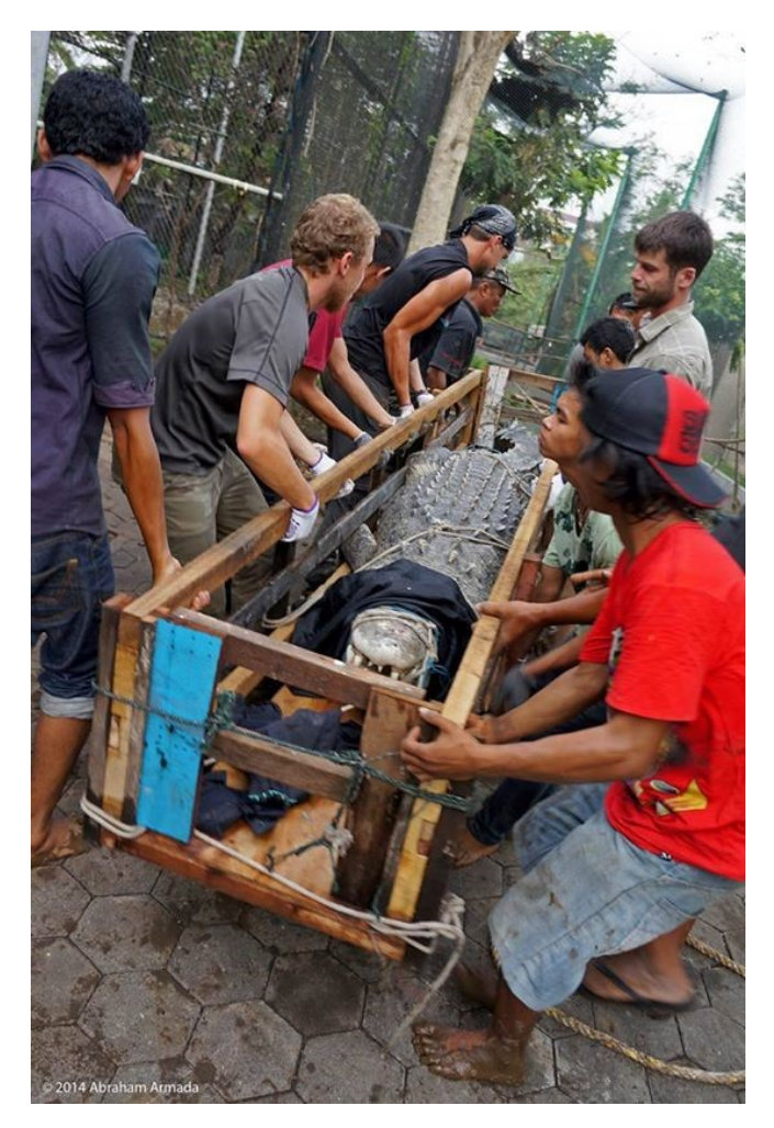
Volunteer moving the crocodiles to their new home at BWRC.

Major changes happened to our Nusa Penida site. The old Bird Sanctuary have been gradually replaced by our brand new facility. The new facility, locally called as Kubu Konservasi FNPF , is an