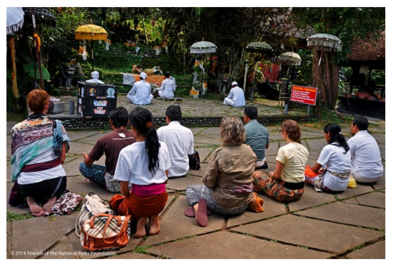
Our staff are praying with the volunteers before releasing birds at Besikalung.