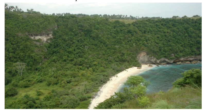
The beautiful and isolated Atuh Beach is always full of trash carried away by the ocean.

Rubbish collecting and waste management are badly needed in Nusa Penida. The island has been invaded by a massive wave of rubbish from the ocean. Situated at the tip of Indian Ocean, the strong current from the east is like a highway for plastic rubbish. Unfortunately, the island is too small and the population is too poor to maintain a working waste management system. This is a serious problem as the island is a place of refuge for many kind of animal such as the sea turtle ( Chelonioidea ), manta ray (Manta), dolphin ( Delphinidae ), southern ocean sunfish ( Mola ramsayi ), and various kind of coral fishes.