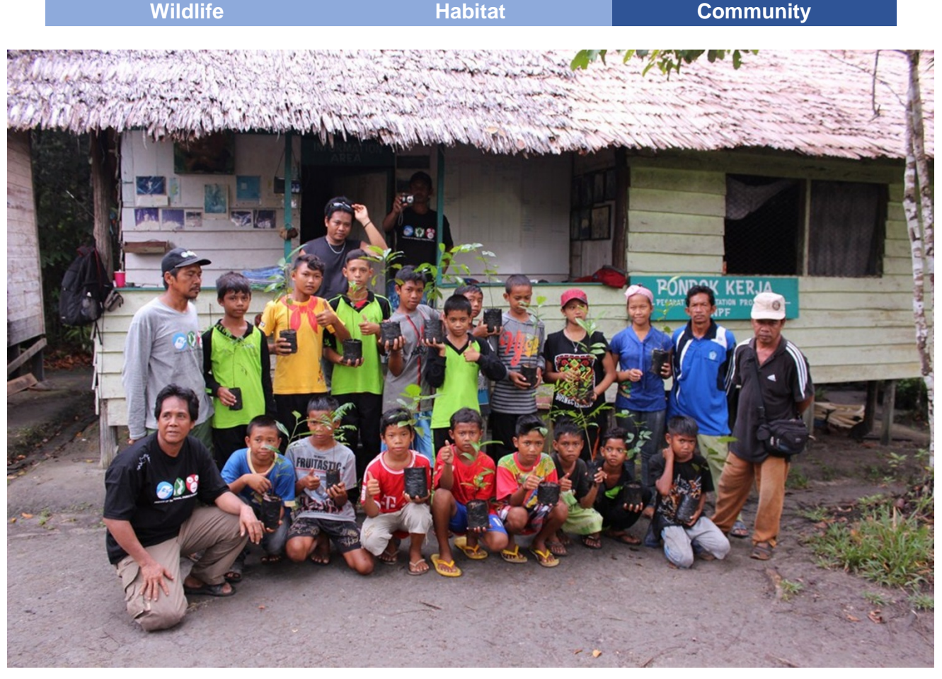
Local students participating in our reforestation activity.