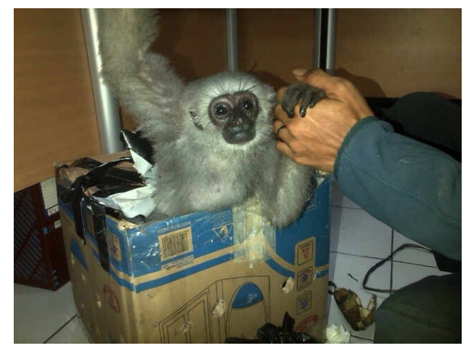
Slilvery gibbon (Hylobates moloch)