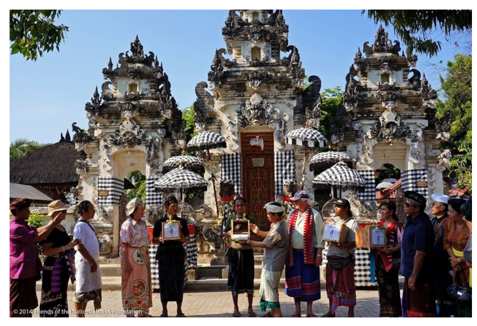
FNPF and Durrell Wildlife Conservation Trust releasing Bali Starlings in 2014.