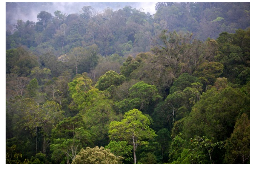
A typical rain forest in Indonesia.

All those factors are the reason why Indonesia is blessed with the world's second highest diversity, only second after Brazil. Once linked to the mainland Asia, Indonesia is home for many Asian fauna such as tigers ( Panthera tigris ), leopards ( Panthera pardus ), elephants ( Elephas maximus ), and rhinoceros ( Rhinocerotidae ). In the eastern part, most of the islands have developed their own unique flora and fauna due to isolation from the continents. The Island of Papua, which was once part of Australia, have a great mix of Pacific and Australian Flora Fauna. In fact, Indonesia has the second highest number of endemic species after Australia. Around 36% of 1,531 species of bird and 39% of mammal species are being considered endemic of Indonesia. In addition, as one of the biggest archipelago in the world, with more than 80,000 kilometers of coastline, Indonesia has one of the highest coral diversity in the world.