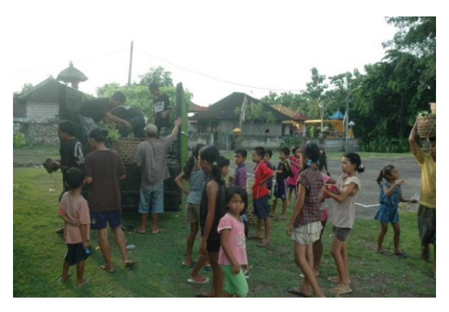
Our staff distributing free saplings to the local villagers.

while smaller forest fires were able to be extinguished. Fire patrols are still the most important deterrence in dealing with forest fire. During the dry season we have to double the patrol as the threats is also higher. Thanks to The Boeing Company, Future Funds, and Humane Society International of Australia, we are finally able to purchase most of the necessary equipment to deal with forest fires.