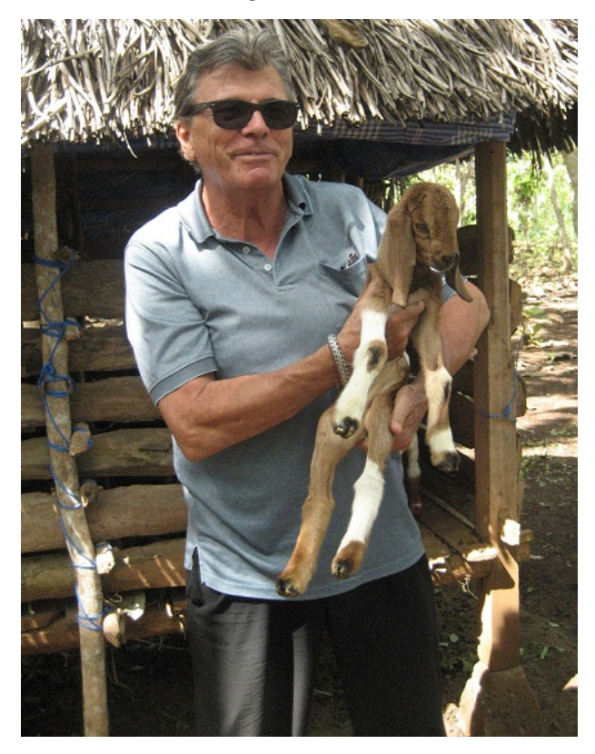
One of the member of Rotary Club of Seminyak pictured before giving the goats to the farmers.

2014 was a very difficult time for the local communities in Nusa Penida. Long summer has destroyed much of the agriculture sector of the island. Sad news came from Saren Village where several goats have died. These goats were part of the joint project between FNPF and Rotary Club Seminyak in 2013. An investigation by our staff revealed that most of the goats died due to neglect from the farmers. Dry season was not the main culprit because some goats were well-fed while others were not. In November 2014, several farmers decided to return the goats because they were unable to take care of them. These goats were moved to our new site while waiting for new farmers who are willing to take care of them.