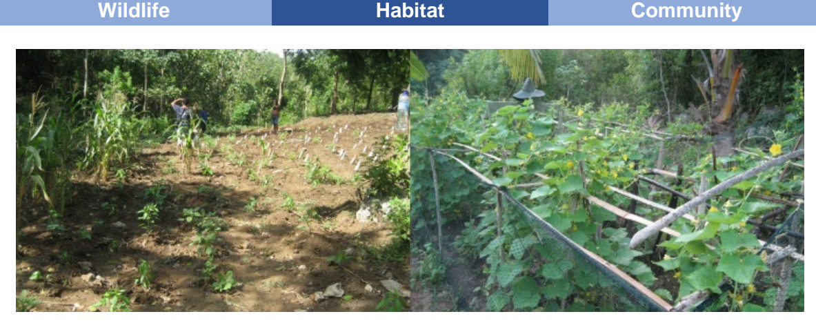
Our humble new organic farm where we grow chilli and cucumber.

Our organic farming program in 2014 was a mixed success. On one hand, we have successfully dealt with the difficult terrain by building a well-designed permaculture farm. On the other hand, we are still trying to find the best plants that can grow in this difficult area. It was a trial and error process that taught us an important lesson. We found that plants with deep roots are hard to grow because the top soil is quite thin. However, small plants such as ginger ( Zingiber officinale ), cucumber ( Cucumis sativus ), eggplant ( Solanum melongena ), rosella ( Hibiscus sabdariffa ), and bird's eye chilli ( Capsicum annuum ) can grow perfectly as long as they get enough water.